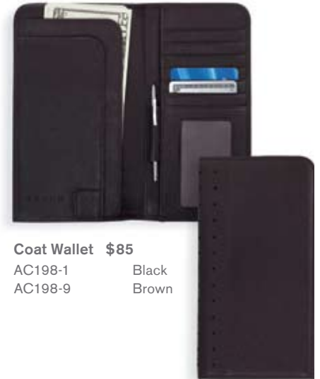
Coat Wallet $85 AC198-1 Black AC198-9 Brown