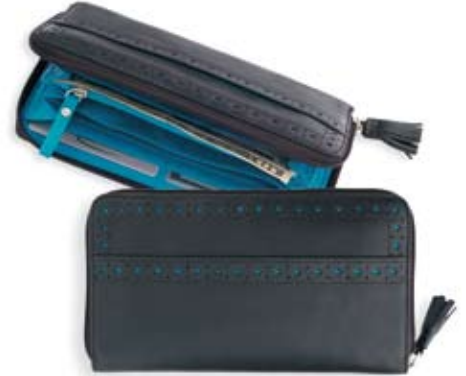
Accordion Zip Wallet $95