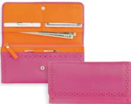
Slim Envelope Wallet $90