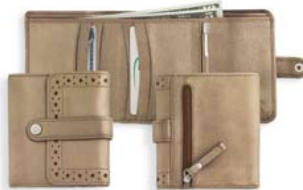
Bifold Coin Zip Wallet $80