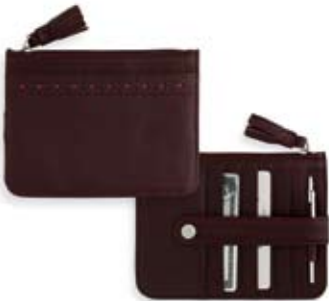
Medium Slim Card Case with Zip $65