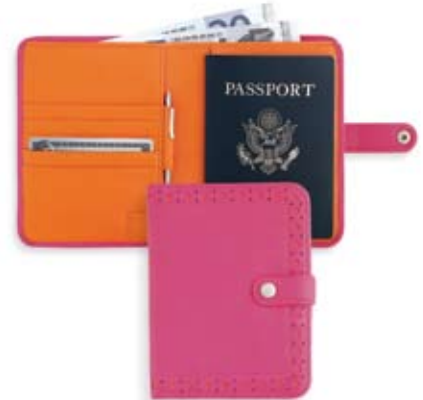
Passport Wallet $75