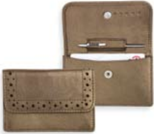
Folded Card Case $55