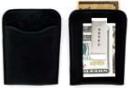
Money Clip Card Case $45 AC122-1 Black AC122-9 Brown

Inspired by the success of our Autocross leather line, our new collection of wallets and money pieces marries practicality with style. Most styles feature a Cross mini pen integrated into the design—perfect for writing a quick note or signature. Both men's and women's styles are made of our signature perforated, full-grain pebbled leather, while the women's styles feature whimsical perforation detailing in contrasting colors.