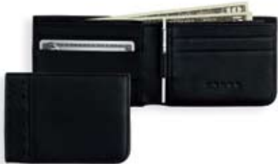
Slim Bifold Wallet $60 AC193-1 Black AC193-9 Brown