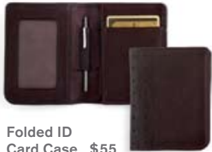
Folded ID Card Case $55 AC192-1 Black AC192-9 Brown