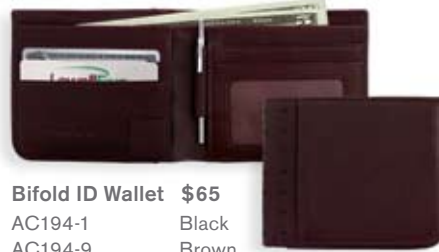
Bifold ID Wallet $65 AC194-1 Black AC194-9 Brown