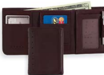
Trifold Wallet $70 AC196-1 Black AC196-9 Brown