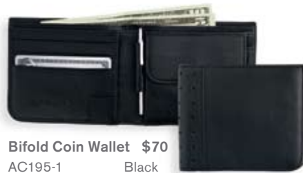
Bifold Coin Wallet $70 AC195-1 Black AC195-9 Brown