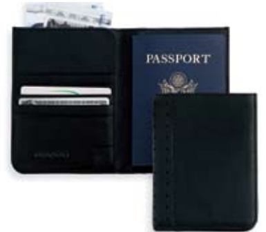
Passport Wallet $55 AC199-1 Black AC199-9 Brown