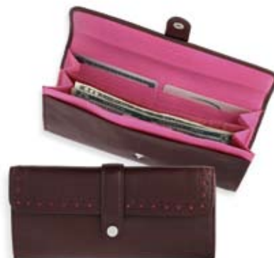
Accordion Fold Over Wallet $85