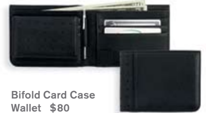
Bifold Card Case Wallet $80 AC197-1 Black AC197-9 Brown