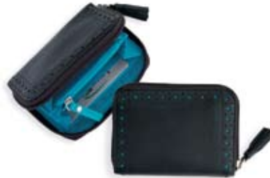
Small Accordion Zip Wallet $70